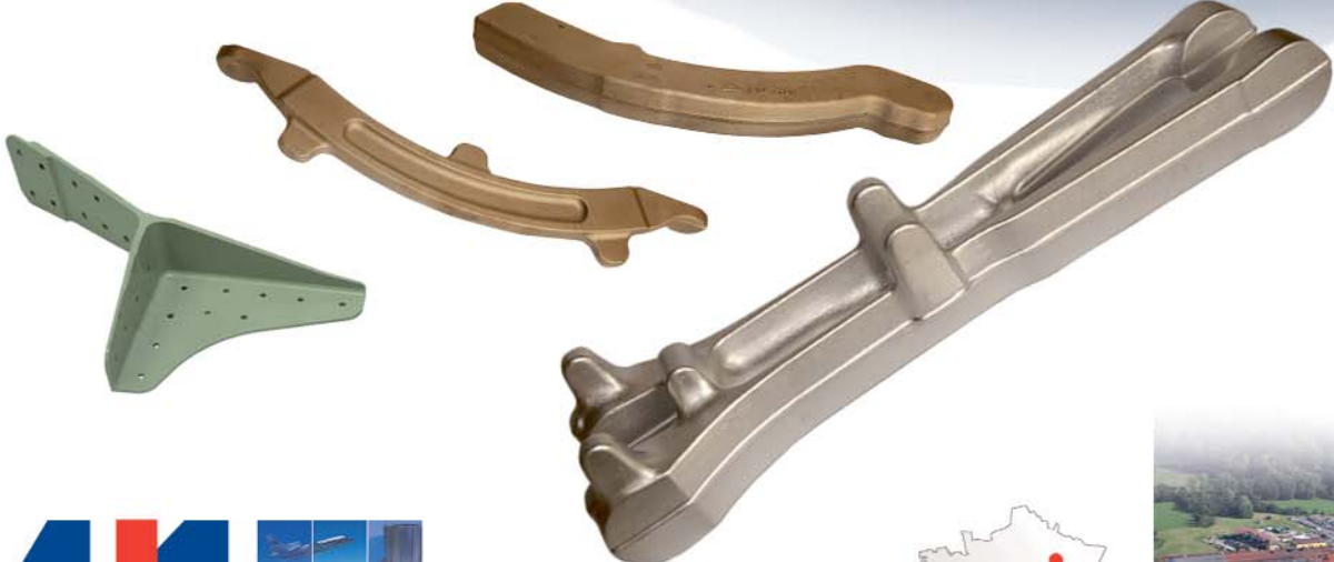
Equipment parts & Airframe components